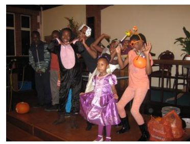
Liaht and Lauahter Party 2013